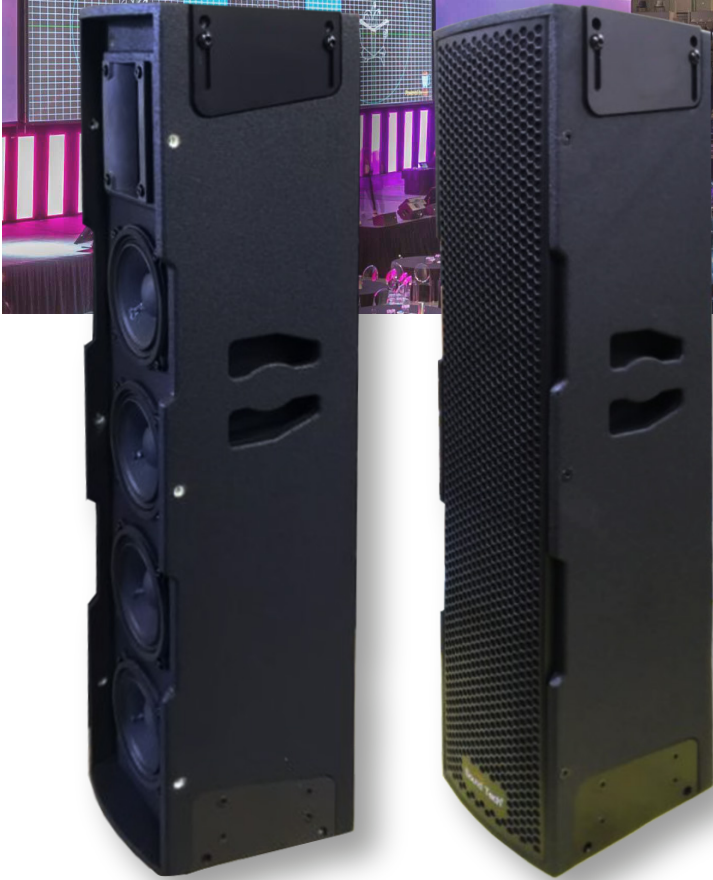
Enclosure Dimension :